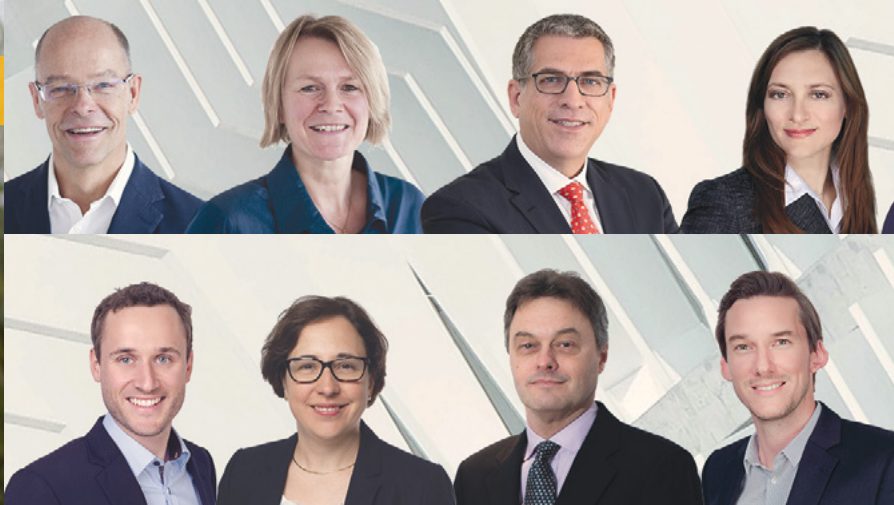
FUND ADVISOR TEAM